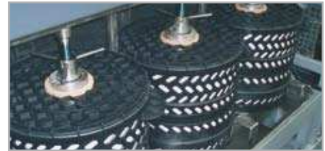
H 34 1290/3