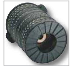
H 34 1790 with conical clearance