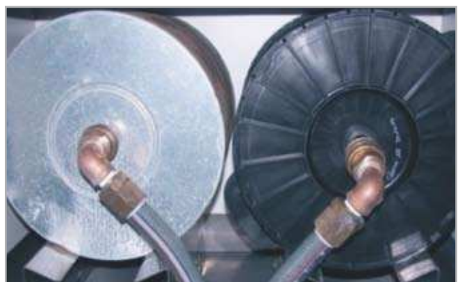
Previously: Metal New: Plastic