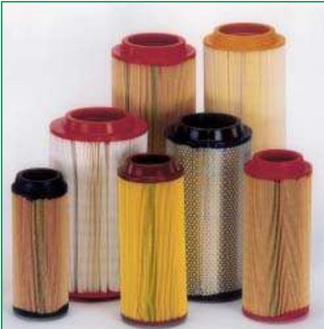
Inferior copies – high risk

Original products have always been copied by pirates and offered at lower prices. But a farsighted operator of a compressed air system will know that copies are products with an inferior quality which do not fit properly and force running costs up. Indeed they endanger the economic running of the compressed air system. In the worst case copies can lead to shutdown of the compressor.